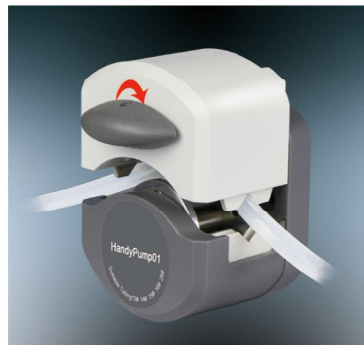
B. Put the tube between rollers and upper block, tighten up the tubing lightly.