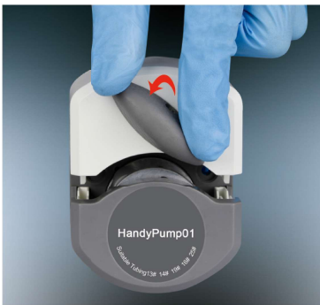
A. Turn the knob anticlockwise 180°, open the upper block.