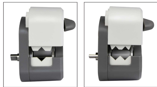
Single channel HandyPump01