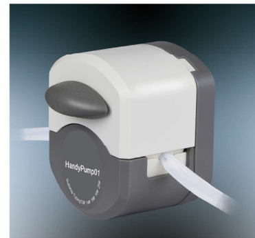
C. Turn the knob clockwise 180°, put the upper block back to original position, fasten the tube.